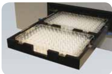
Dual microplate carrier with reagent plate and measurement plate

Unlike a conventional microplate reader, the NOVOstar has a dual microplate carrier that allows the user to designate one as a reagent plate and the other as a measurement plate. An integrated transfer pipettor delivers compounds from the reagent plate or from one of the three reagent stations to the measurement plate allowing the user to prepare wells or start kinetic events. Using this system, up to 384 compounds can be screened in a signalling assay - virtually impossible to do using a conventional plate reader. Additionally, two on-board reagent injectors can deliver variable volumes of reagent to wells giving you a wide range of liquid handling options, combined with the measurement abilities of a conventional multifunctional microplate reader.