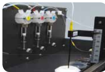
Advanced liquid handling with one pipettor, two reagent injectors, and three reagent stations

The NOVOstar is optimized to monitor fast kinetic events, such as calcium flux. These types of assays can easily be triggered using the transfer pipettor or one of the two built-in injectors. Reagent addition and measurements can be undertaken