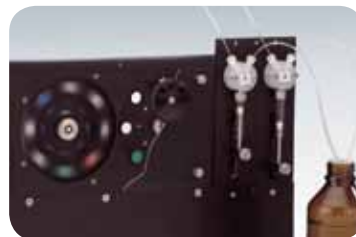
...reagent injection and fast filter switching

The control software puts you in command over injection timing and pump settings such as injection speed, delivery volumes and the number of reagent injections per well. Kinetic data can be collected at a rapid 50 reading points per second, or as slow as one point every 2½ hours. Furthermore, data can be collected at different rates within the same experiment, allowing you to monitor the signal when and where needed.