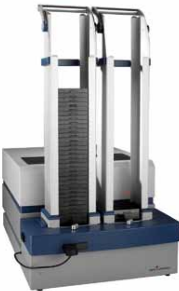
...automated plate handling with Stacker

For medium level throughput, BMG LABTECH offers the Stacker with an integrated barcode reader. For higher throughput, the FLUOstar OPTIMA can be integrated into many types of robotic systems from a variety of different manufacturers.