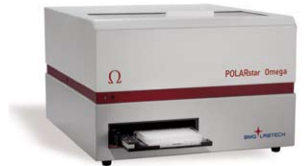
Fig. 1: BMG LABTECH's POLARstar Omega multidetection microplate reader with fast absorbance spectrometer

dsDNA Quantitation Reagent from Molecular Probes® for example is a highly sensitive fluorescent assay for double stranded DNA (dsDNA).