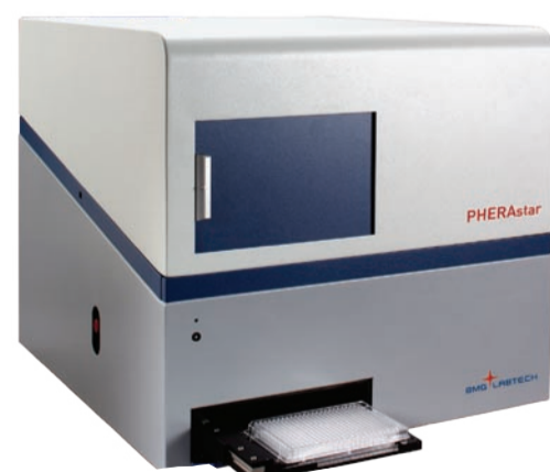
Fig. 1: BMG LABTECH's multimode plate reader PHERAstar.

Induction was monitored at 0, 1-, 2-, 3-, and 5-hour time points. At each time point, ViviRen™ substrate was added by the Equator at a final concentration of 60 µM, luminescence reporter signal was recorded, followed by addition of the CellTiter-Glo® reagent by the Equator. Luminescence was recorded a second time to measure ATP content and cell number.