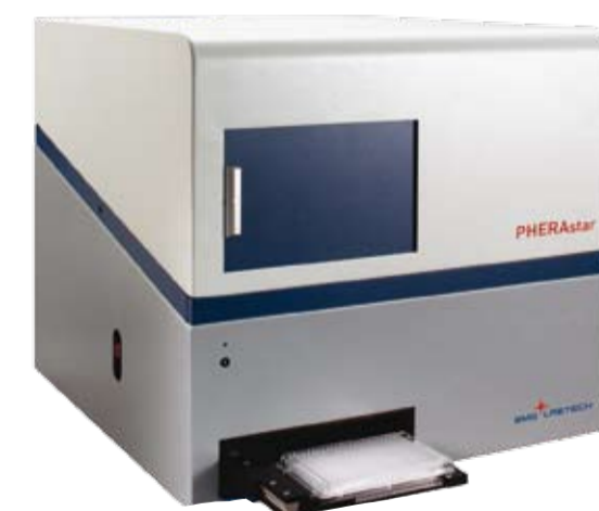
Fig. 3: BMG LABTECH's multimode plate reader PHERAstar.

The results suggest that the cell population studied is less viable over the range of treatment due to an increase in apoptosis, as opposed to necrosis. For all cell viability and apoptosis multiplexing combinations, results in 1536 format are comparable to results in 384-well format.