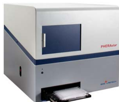
Fig. 1: The new multimode microplate reader PHERAstar is optimized to perform HTS assays in plate formats up to 1536-wells.

Modified versions of Taq polymerase are unable to extend primers that are mismatched at their 3' terminal base. This is used to discriminate the two alleles. The reaction is monitored by the creation of fluorescence from two novel FRET reporter oligos that are included in the reaction. All reactions were conducted in a volume of 1 \mu L (1536-well plates) or 2 \mu L (384-well plates) and thermal cycled in a H2OBIT thermal cycler (KBiosystems, Basildon, UK). The PHERAstar, BMG LABTECH's new multimode microplate reader, has been applied for fluorescence intensity measurements (figure1).