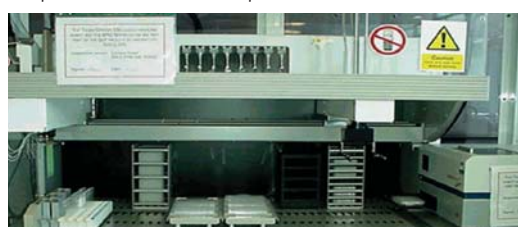
Fig. 1: Photo of the BMG NEPHELOstar integrated with a liquid handling robot.