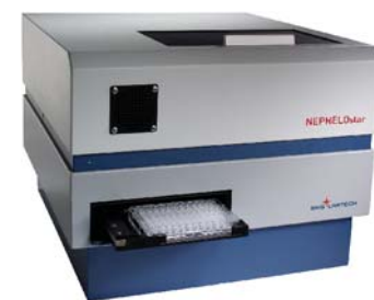
BMG LABTECH's NEPHELOstar