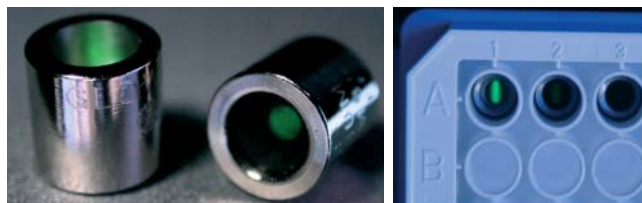
Fig. 2: Left: Glowwell calibration devices Right: Glowwell calibration devices in a 96-well plate

In summary, the inclusion of a Glowwell allowed the reliability of the POLARstar OPTIMA to be ascertained. Unlike biological controls, Glowwell standards provide a long term, stable light output. Finally, Glowwell devices produce a pre-measured light output allowing conversion of relative light units to quantitative measurements.