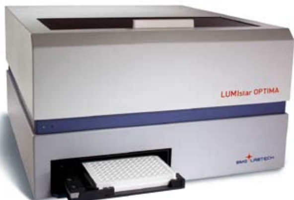
Fig. 1: LUMIstar OPTIMA microplate reader