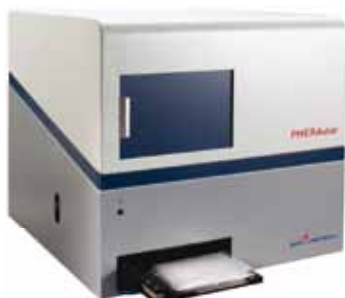
Fig. 1: BMG LABTECH's multidetection plate reader PHERAstar, the forerunner of PHERAstar Plus

This application note demonstrates the use of the IP-One HTRF ® assay for a functional selection of clones from stably transfected recombinant CHO-M1 cells. The measurements were performed on BMG LABTECH's PHERAstar (Figure 1).