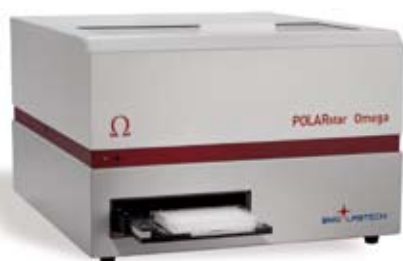
Fig. 1: BMG LABTECH's POLARstar Omega multimode detection reader with fast absorbance spectrometer

Where A is absorbance, \epsilon is the molar extinction coefficient, b is the path length, and c is the analyte concentration. With the spectrometer, the POLARstar Omega (Figure 1) offers easy handling for DNA measurements. The integrated path length correction and the new data analysis software, MARS, allow for fast determination of DNA concentration in samples.